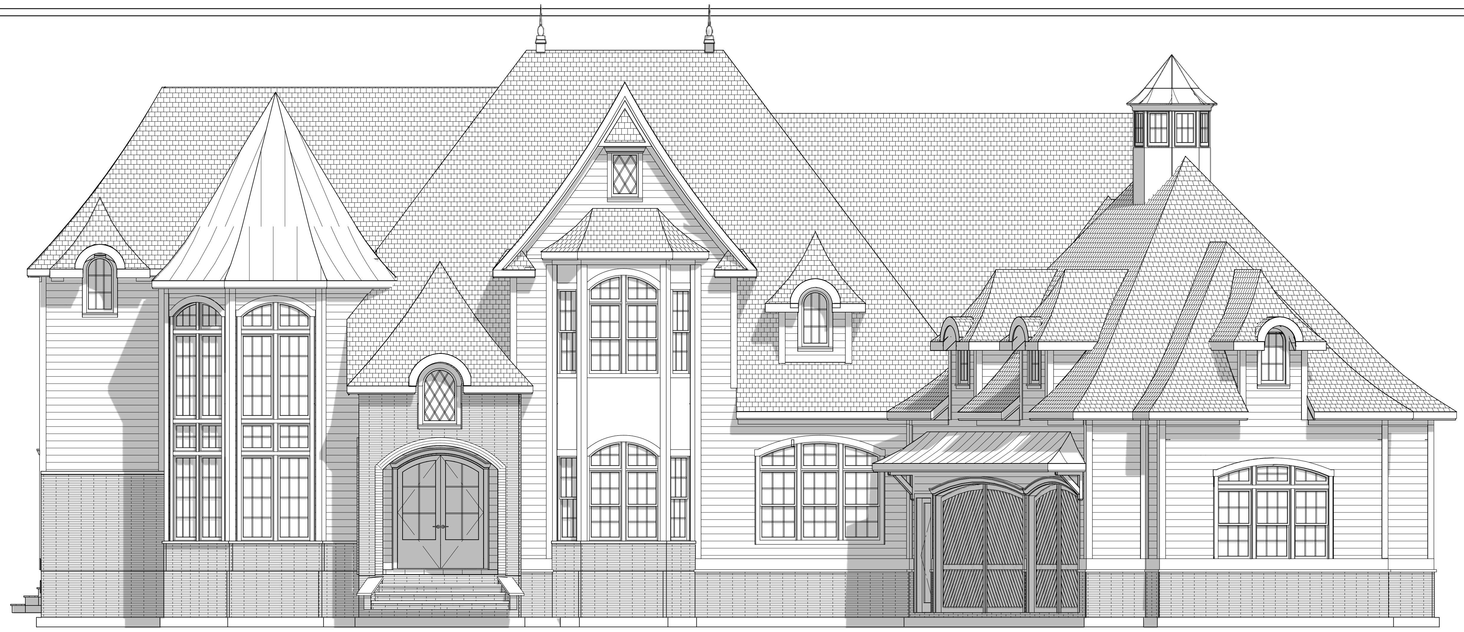
A FRONT ELEVATION A-1 1/4" = 1'0"