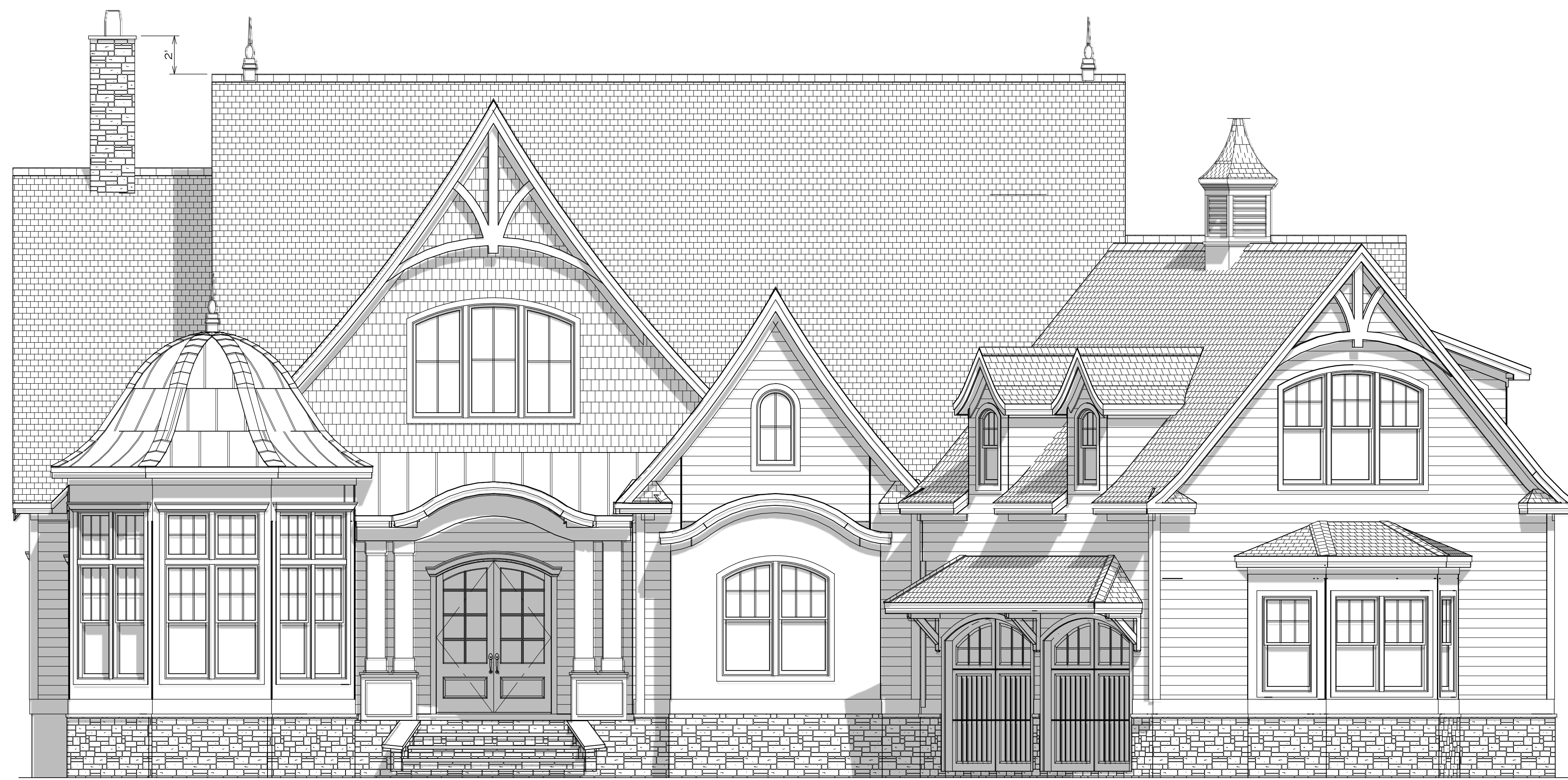
A FRONT ELEVATION A-1 1/4" = 1'0"