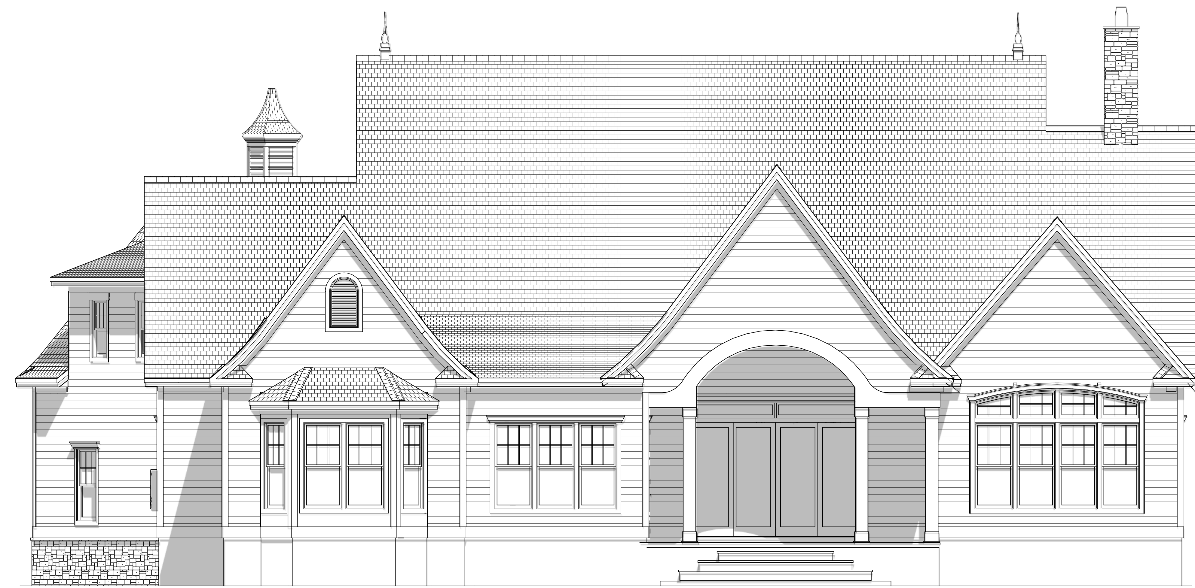
D BACK ELEVATION A-1 1/4" = 1'0"