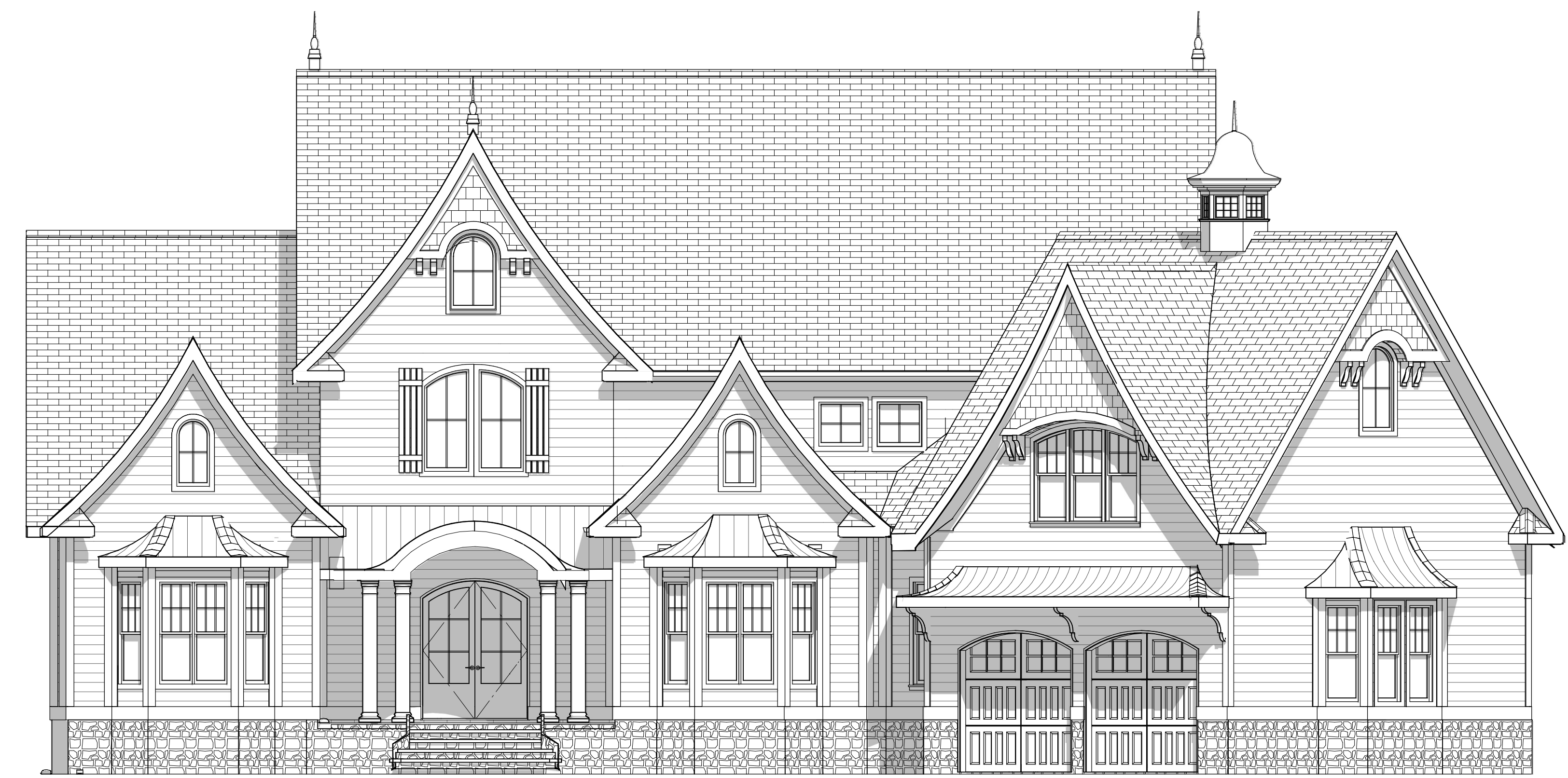
A FRONT ELEVATION A-1 3/16 IN = 1 FT