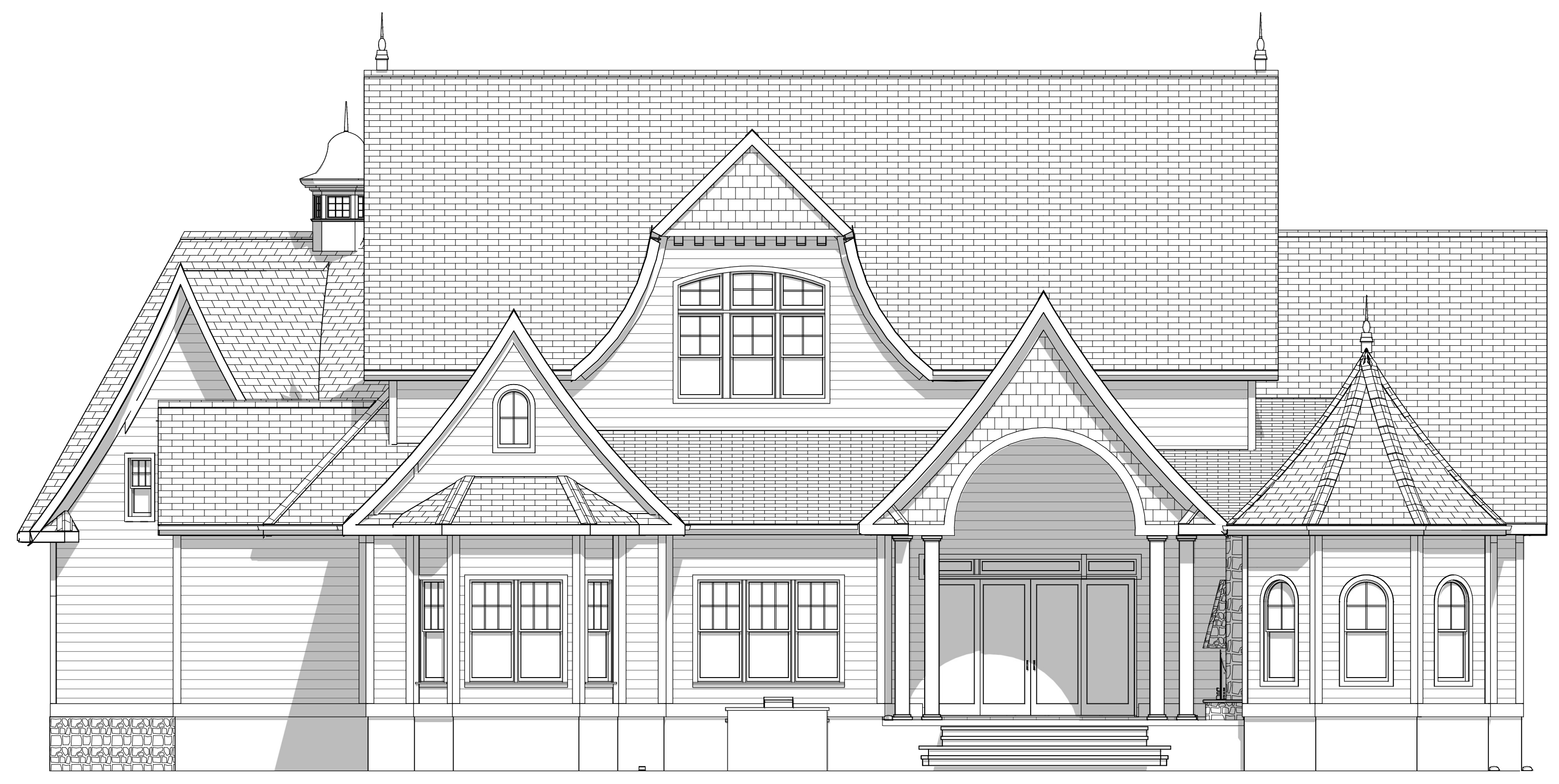
D REAR ELEVATION A-1 3/16 IN = 1 FT